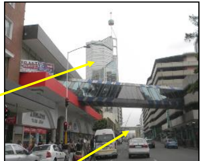
Western skybridge from Pine Parkade